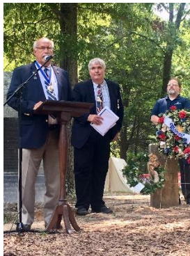
July 14 Battle of Huck's Defeat

South Carolina News/ Examples of Fellowship with other Fraternal Organizations for the purpose of “branding” Sons of the Revolution and Recruitment of New Members.