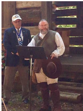
July 28 Liberation Day at